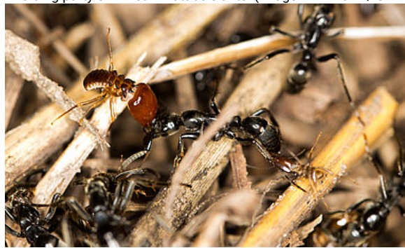
A Matabele ant is bitten by termites during a fight.