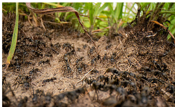
A raiding party of African Matabele ants.