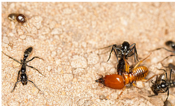
A Matabele ant kills a large termite soldier using its stinger.